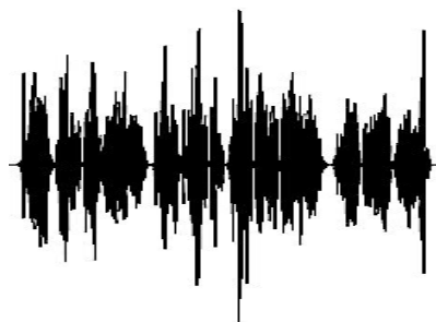
Audio recording of Performance